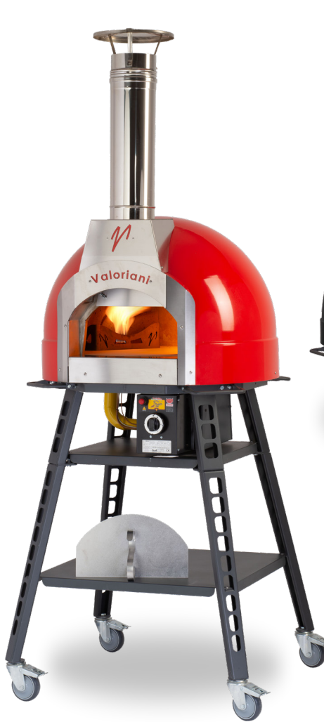
48144 / 48143